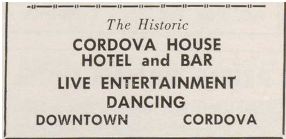
Lou Jacobin's Guide to Alaska – 1971