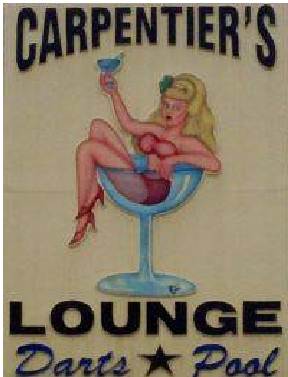
Sign outside the bar